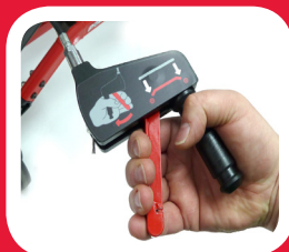
Manual release handle