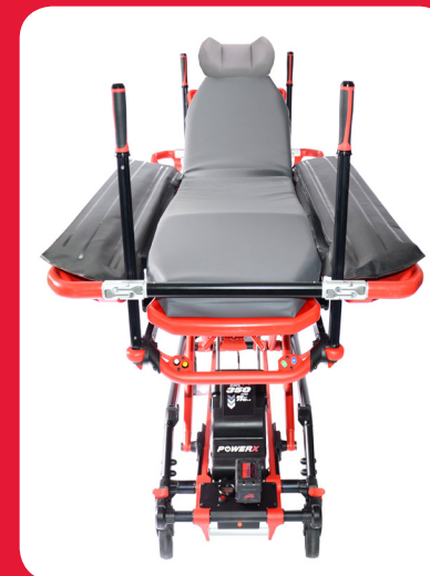
*Split-Scoop Large Patient Surface