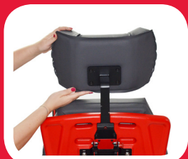
*Adjustable winged headrest