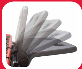
*SX Surface Xtenders ratcheting cotside (Extended patient surface)