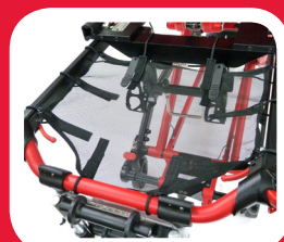
*Storage net head-end