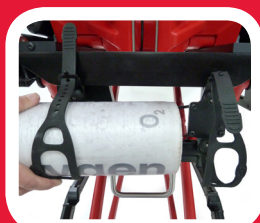
*CD/ZA O2 cylinder holder