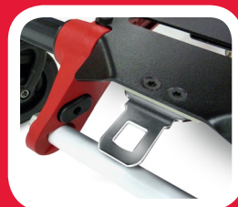
Winch-link for assisted loading on ramps