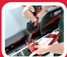
*Detachable 3-stage telescopic IV Pole