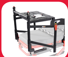
*PacRac+, for holding medical equipment