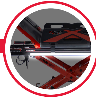
Side-lighting for improved visibility