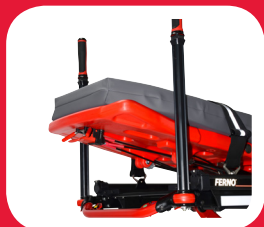
Storable head and foot-end Push-Poles