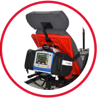
Latching defibr hook for safe handling of equipment

Increasing reliability, combined with 12 month service intervals and minimum replacement part requirements reduces equipment whole-life cost