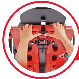
Easy to operate backrest positioning