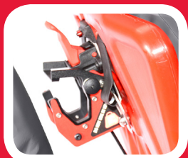
*Backrest monitor hook