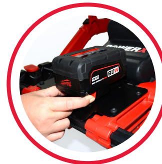
Detachable 28V DC, 5Ah Battery