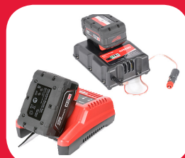
*12v or 230/240v battery charger options