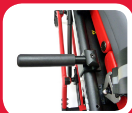
*Side-fixing manoeuvring handles