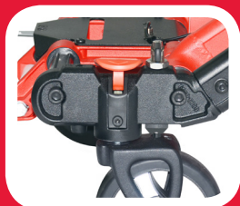
Directional wheel locks at head-end