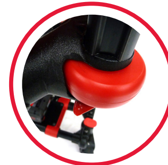
Anti-bump wheels on all four corners

Non-contoured flat Anti-Bacterial Pressure Reducing mattress provides the optimum stretcher height, making lateral patient transfers fast, safe and easy